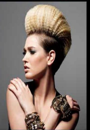
Express your star power with the ultra sexy short disconnected woman's cut and customized men's clipper cut

3 unique ways to style both cuts to take your client from day to the club and then pushing the limits with an avant-garde look