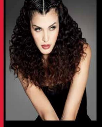
Love your long hair again with this remarkable cut that adds sultry layers yet maintains the density of long hair.